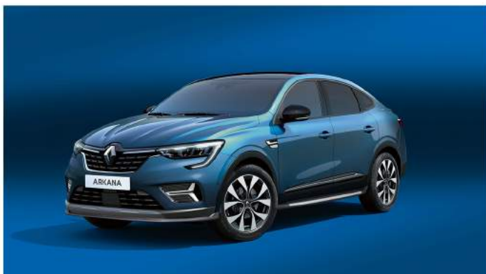
zanzibar blue (RRF)