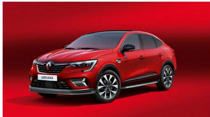
flame red (NNP)