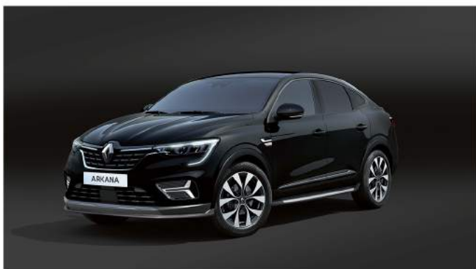
metallic black (GAX)