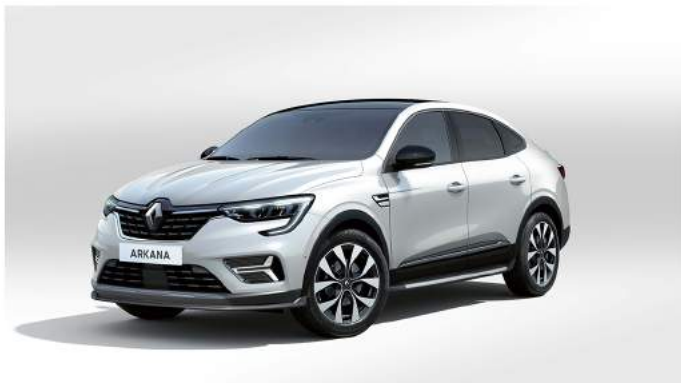
pearl white (QXD)