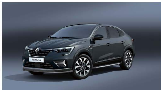
metallic grey (KAD)